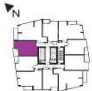
FLOORS 5 - 41

ALL DIMENSIONAL AREAS AND DRAWINGS ARE APPROXIMATE, SIZES AND SPECIFICATIONS ARE SUBJECT TO CHANGE WITHOUT NOTICE. ALL ACTUAL USABLE FLOOR SPACE MAY VARY FROM THE STATED FLOOR AREA. BALCONIES SHOWING MAY CONTAIN TERRACE FLOOR TILES AND STEP UP TO BALCONY DOOR. SUITE PURCHASED MAY BE HORIZONTAL IMAGE OF FLOOR PLAN LAYOUTS SHOWN, E.G.O.C.